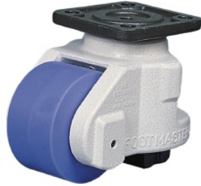
GD-150F-B (Wheel with ball bearing)